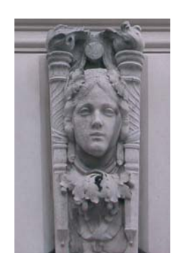
Above & right: 30 Kensington Church Street London W8

Last year I reported on the acquisition of an apartment complex at Fort Lauderdale, Florida. As planned, we have refurbished the complex and it has been substantially re-let during the year at enhanced rentals. This has resulted in an independent professional revaluation as at 31 March 2005 of $51.4 million, an uplift of 84%. Originally acquired for trading, this property will now be retained for the longer term and accordingly has been reclassified as an investment property. So far