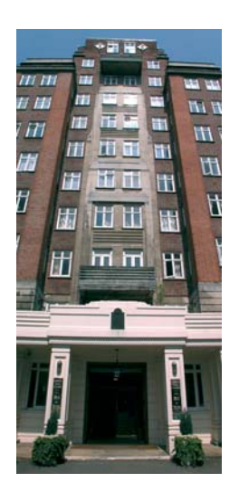
Below: Grove Hall Court St John's Wood London NW8